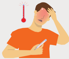
FEVER (Temperature of 37.8°C or greater)