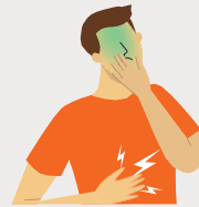
NAUSEA/VOMITING, DIARRHEA, ABDOMINAL PAIN