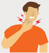
SORE THROAT OR DIFFICULTY SWALLOWING