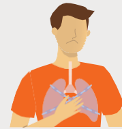
SHORTNESS OF BREATH (Dyspnea)