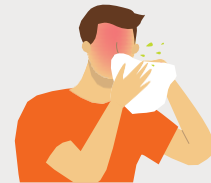
RUNNY NOSE, OR NASAL CONGESTION Unrelated to seasonal allergies, post nasal drip etc.

AN ACKNOWLEDGEMENT THAT YOU HAVE COMPLETED THIS SCREENING, A VISUAL HEALTH CHECK AND TEMPERATURE MEASURE WILL BE REQUIRED PRIOR TO ENTRY TO THE CHILD CARE