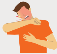
NEW OR WORSENING COUGH